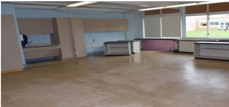
Elementary floor before being renovated.