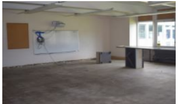
Concrete is prepared.