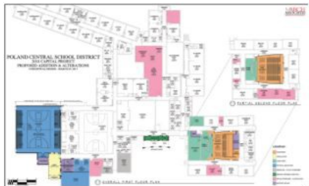
The Capital Project 2020's initial gym, auditorium, vestibule, and track layouts.