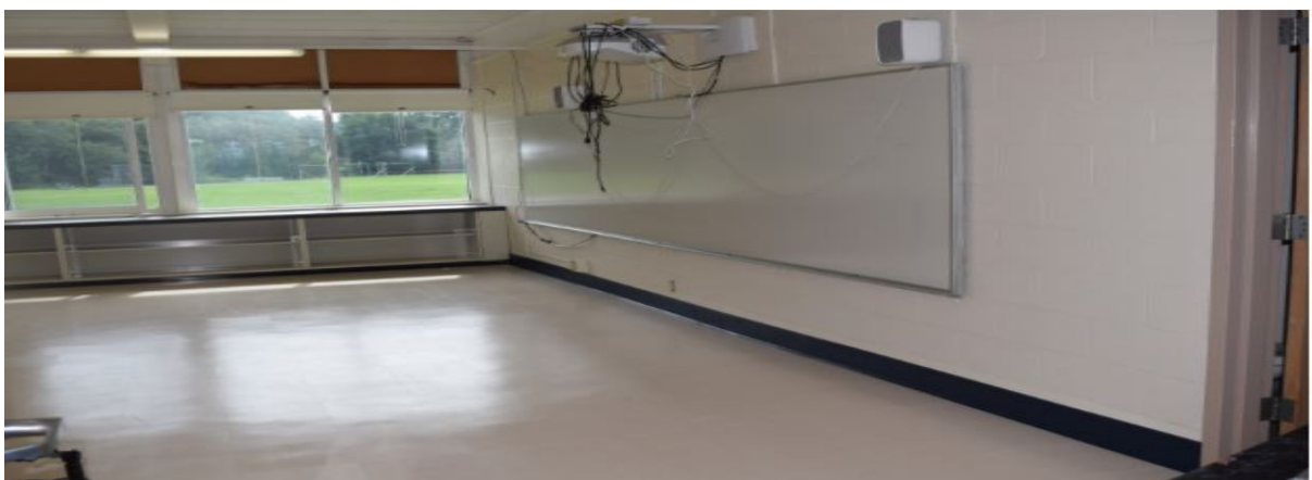
Elementary floor after being renovated.